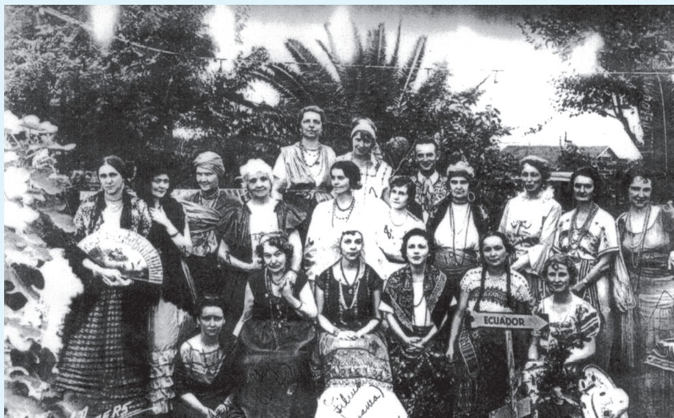
Members of the Pan American Round Table I posed in costumes to stimulate interest in Charro Days. Circa 1938

help in any way she could, taking many of the women and children into her own home to feed and shelter them.