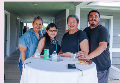
April Historical Happy Hour