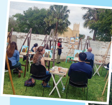
Sip N' Paint