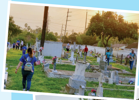
Memorial Day at the Old City Cemetery