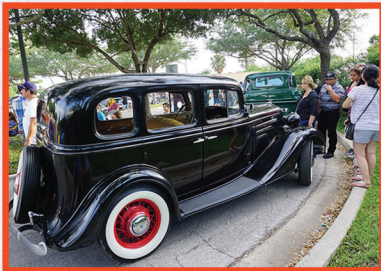
4th Annual Father's Day Classic Car Show