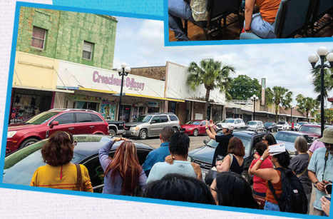
Historic Preservation Month Tour & Lecture