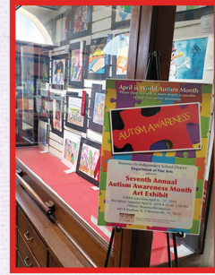
B.I.S.D.: Autism Awareness Exhibit & Reception