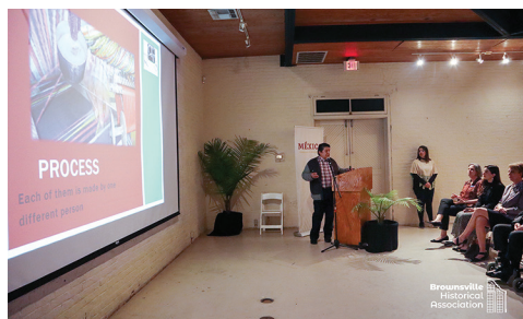
Rezos Artesanales Lecture