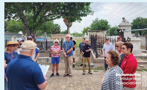
Winter Walking Tour: Old City Cemetery