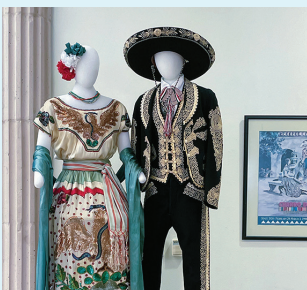
Charro Days Exhibit in Collaboration with Brownsville Museum of Fine Arts and Charro Days Fiesta.