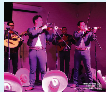
Una Noche de Amor con Mariachi 7 Leguas Concert