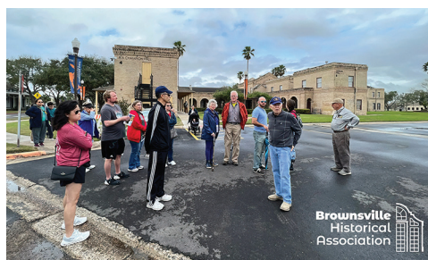
Winter Walking Tour: Fort Brown